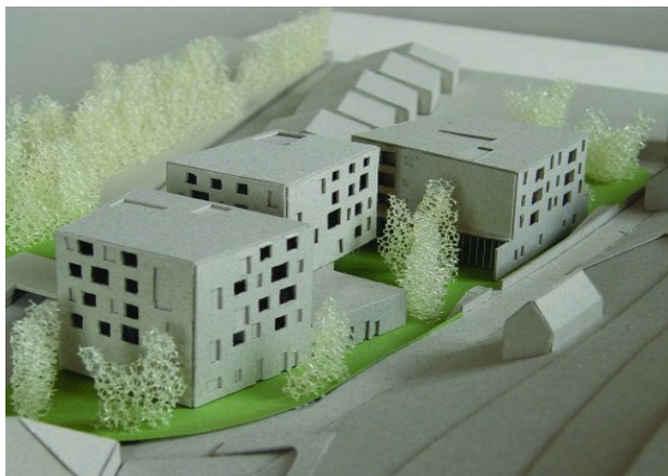
The future look of the Residential Care Home

Project holder: City of Senj Address: 53 270 Senj, Obala dr. Franje Tuđmana 2 Website: www.senj.hr