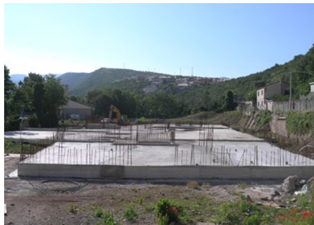
Commenced works on the site